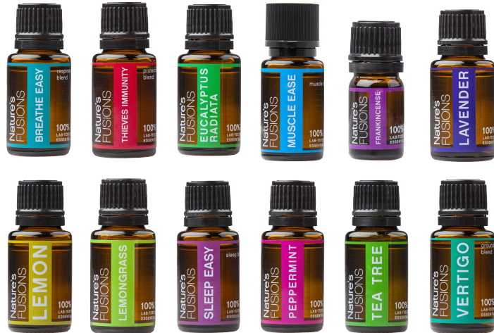
Essential Oil Singles & Blends (15mL)